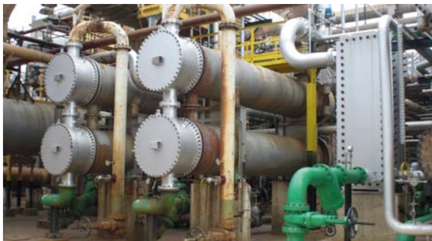
With its compact design, compared to a shell-and-tube heat exchanger, Compabloc can be installed where floor space is limited.

In 2005, Replan replaced two shell-and-tube units with one Compabloc vertical condenser at the vapour compression stage, providing 20% additional heat transfer capacity in a smaller space. Two more Compablocs, with plates in 254 SMO, were installed in the naphtha fractionation unit as top condensers in 2007.