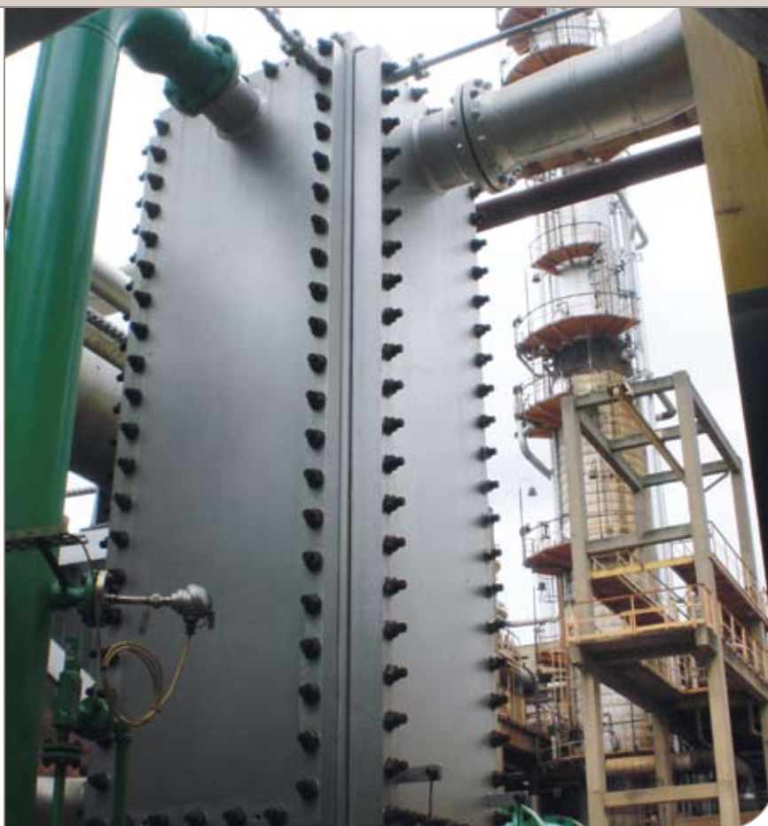
Petrobras' Replan Refinery in São Paulo has installed Alfa Laval Compabloc compact heat exchangers in the sour water stripping unit and the FCC unit.

Osmar Vallim Pedroso: "We chose compact heat exchangers due to their high efficiency. Also because it's possible to install a Compabloc in a reduced footprint area for revamping projects. To get the same heat transfer capacity using shell-and-tube units requires more space, and material and installation costs are much higher."