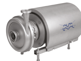
Alfa Laval LKH centrifugal pump.

Typical centrifugal pump life cycle cost (based upon Alfa Laval's Solid C-3 pump (11 kW) over 10 years).