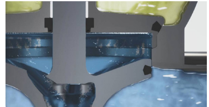
Figure 3. Seat push: The lower plug is pushed downwards thus cleaning the plug seal, seat and leakage chamber through CIP flow.