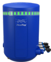
Figure 4. Alfa Laval ThinkTop V70.

Burst seat cleaning provides exceptional cleaning of double-seat mixproof valves while reducing the amount of CIP liquids used during cleaning procedures. During burst seat cleaning, the seat quickly opens and closes, allowing a highly effective burst of CIP liquid to clean the surface during seat lift. The difference in pressure forces the CIP liquid through the narrow opening in the valve. This creates high shear forces that contribute to achieving the highest possible cleaning efficiency compared to simply allowing the CIP liquid to flow over the seat for a given period of time. During the initial movement of a seat lift or seat push, the shear stress of the CIP liquid on valve surface is at its highest. In the following fractions of a