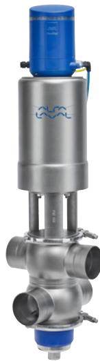
Figure 1. Alfa Laval Unique Mixproof valve with the ThinkTop V70 control unit.

This puts enormous pressure on manufacturers to use resources wisely and to reduce water consumption during production. Cleaning process equipment, such as mixproof valves, can contribute significantly to reduced water use. Alfa Laval can help manufacturers realize substantial water savings – without compromising product hygiene or safety – by using Alfa Laval Unique Mixproof valves with innovative ThinkTop control tops.